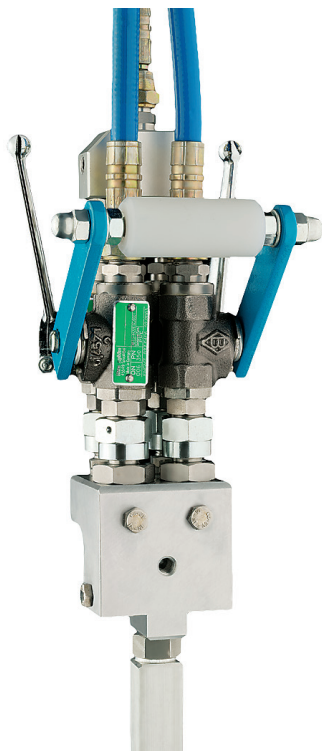
Mixing unit complete with static mixer and separate flush assembly for the A and B components