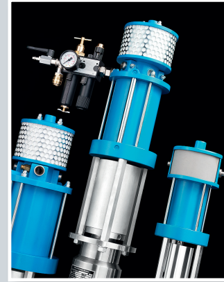
WIWA material feed pumps for almost every application field