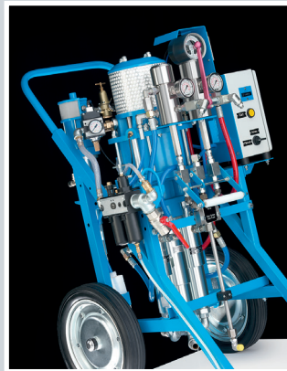
WIWA DUOMIX 2K airless paint spraying systems