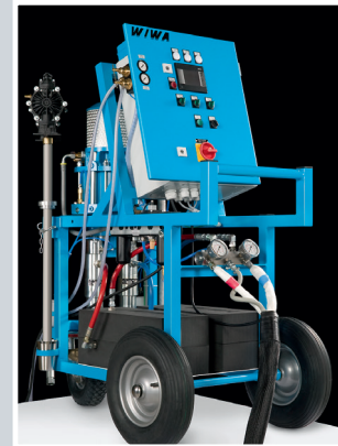
WIWA PU 460 polyurea systems