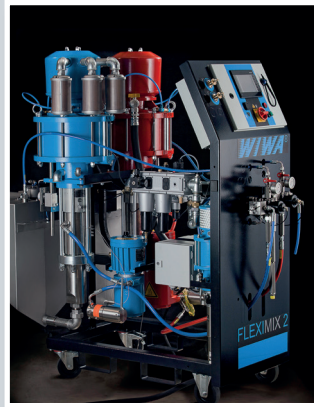
WIWA FLEXIMIX, electronic 2K painting and coating systems