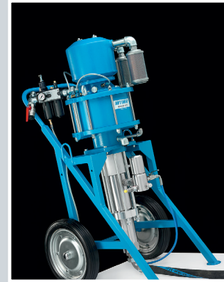
WIWA airless, air combi and hot spray systems