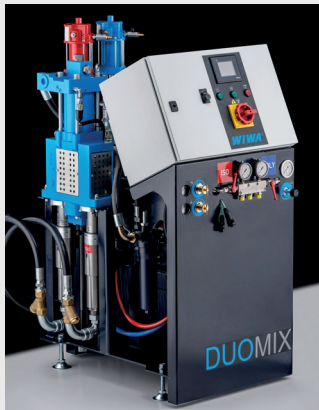
WIWA DUOMIX PU HX, hydraulic plural component spray equipment