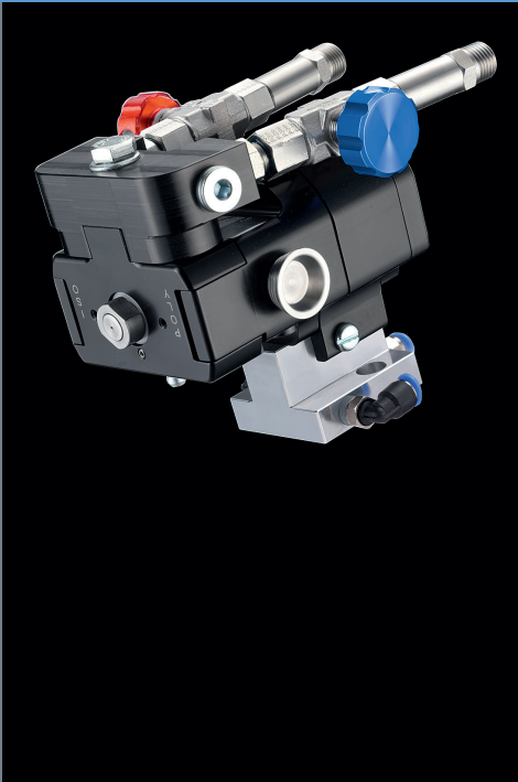
WIWA PU GUN 4040 automatic gun