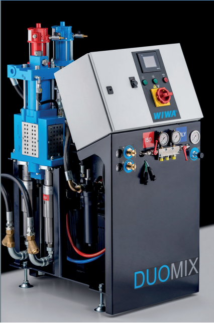
WIWA DUOMIX PU HYDRAULIC