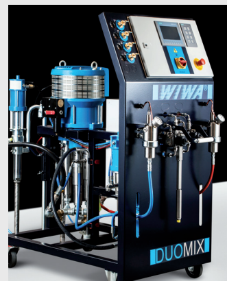
WIWA DUOMIX, pneumatic plural component spray equipment