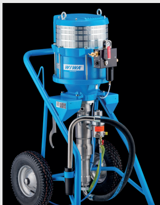
WIWA HERKULES 333 GX, single feed (airless) spray equipment