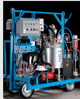
WIWA DUOMIX 333 PFP ATEX, for intumescent fire protection material