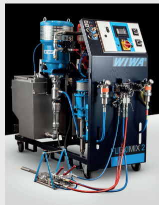
WIWA FLEXIMIX 2 electronic plural component spray equipment