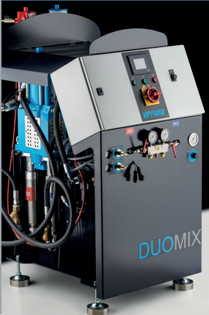
WIWA DUOMIX PU HYDRAULIC - with hose rack