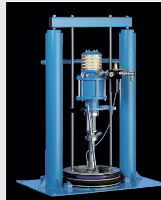
WIWA VULKAN, pneumatic extrusion equipment