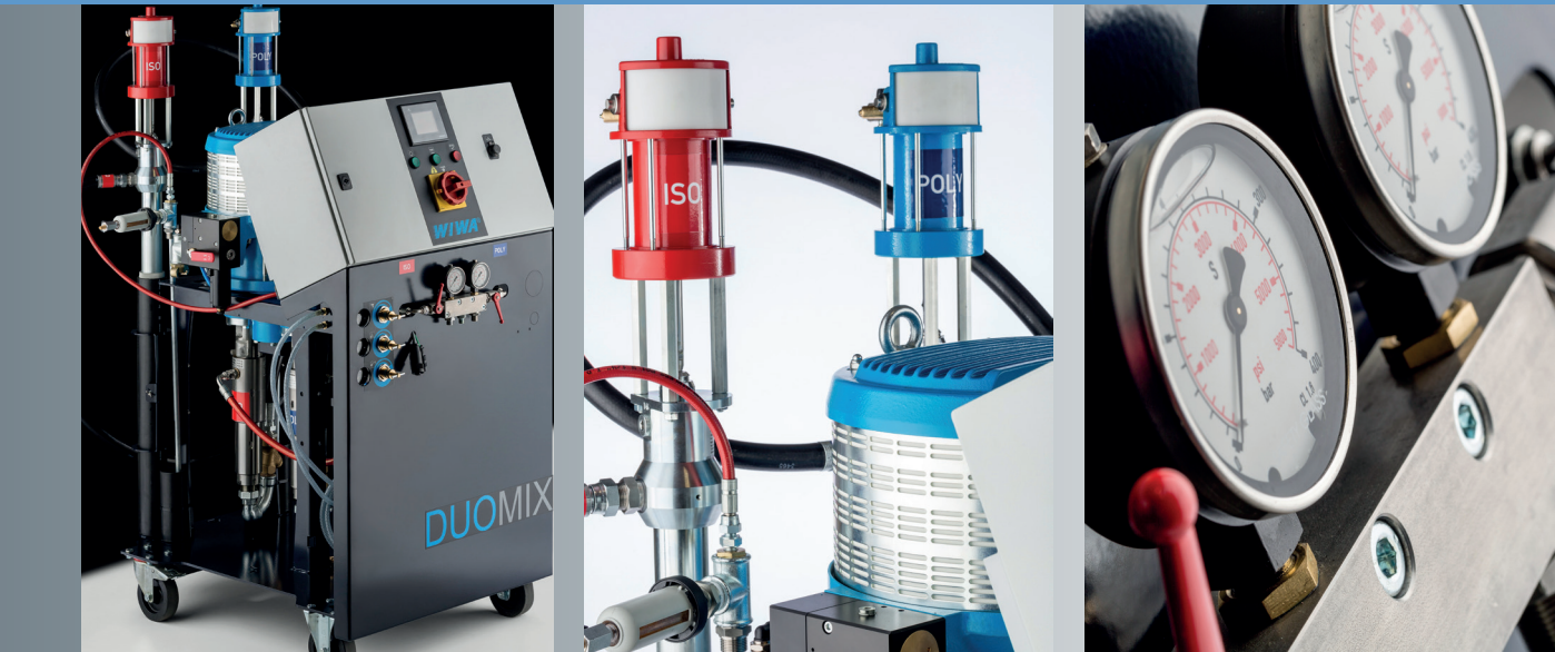
WIWA DUOMIX PU 540 on cart